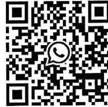
QR Code to Join WhatsApp Group